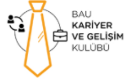
Career and Development Club